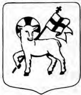
Agnus Dei The Lamb of God

Choir stalls line the chancel. Again they are carved with flowers and leaves. The altar is in a three-sided apse at the east end. Discover carved symbols of the crucifixion, ladder, sponge, spear, nails, hammer, dice and crown of thorns. The side panels contain the alpha and omega (God is first and last). The Lamb of God (Jesus) is depicted on a floor-tile in front of the altar.