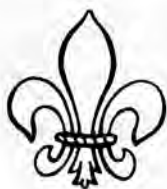
Fleur-de-lis Holy Trinity

Return from the chancel and turn right into the transept. A painting of a 'Dispute over the Sacraments' hangs on this wall of the transept. In the window nearby Jesus heals a blind man. Symbols include a snake on a stake (evil conquered), XP (Christ Jesus) and a cruciform halo (Risen Jesus). The window in the facing wall of transept is a decorative arrangement of the letters IHC (Jesus), fleurs-de-lis (Holy Trinity), lilies and other flowers (Mary).